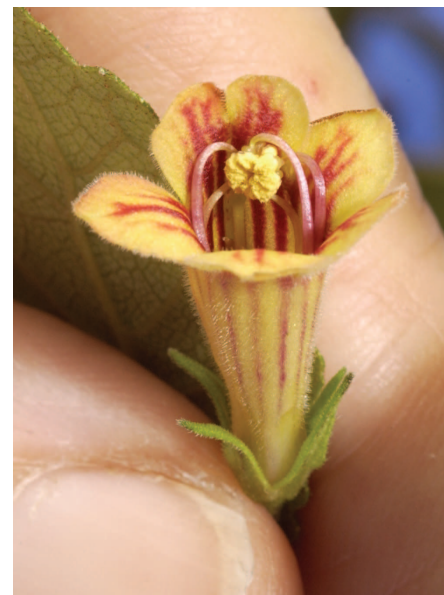
Fig. 1. A flower of R. solandri viewed from underneath, showing the narrow 10-mm-long corolla tube and the ridged fused pollen disc that is marked if the flower has been visited by a bird. The stigma elongates after pollen presentation is finished, so the flowers require bird visitors for successful fruit set.

Interestingly, this pattern of few bird visits to flowers on the mainland and frequent nectar robbing by silvereyes was already established by 1902 (21). If, as we believe likely, pollination failure began around 1870 when bellbirds and stitchbirds vanished from the upper North Island, there should have been time for reduced regeneration of R. solandri to become evident. This appears to be the case, with plot surveys in forested areas containing R. solandri showing similar densities of adult plants ( \geq 30 cm tall) on mainland versus island sites (Fig. 3; F_{1,52} = 0.347 , P = 0.558 ) but significantly lower densities of juveniles ( < 30