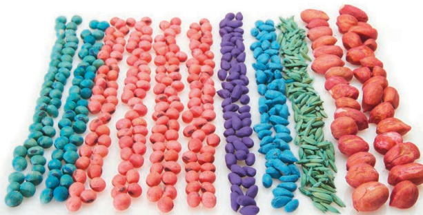
Diverse. Neonicotinoid-treated seeds are used in many crops, including soybeans, cotton, rice, and peanuts. Color serves as a warning.