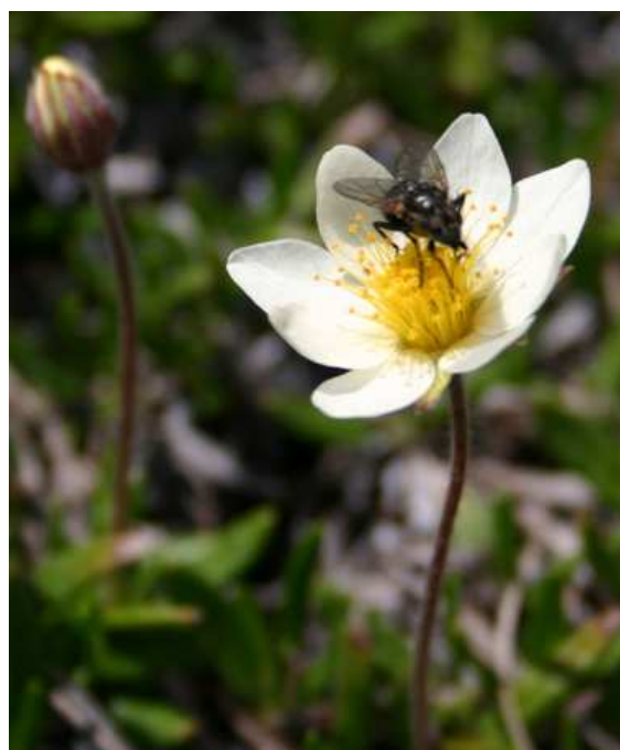
Figure 3. A fly feeding and pollinating on a sun-wise blossom of Dryas integrifolia

sun for at least part of the day. The mastodon flower ( Senecio congestus ) (Figure 5) can also bend its shaggy, multiple daisy heads towards the sun when the sun is high.