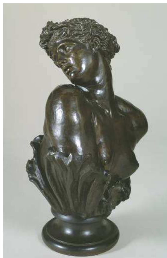
Figure 1. Bust of Clytie, head craning round and surrounded by sepals. Sculpture by George Frederick Watts (ca. 1878) (Tate Gallery, London, UK)

Scholars often assume that flower Clytie became is the heliotrope ( Heliotropium europaeum ). The first part of the Latin name, Heliotropium , literally means, 'turning with the sun'. 'Diaheliotropism', the term used by botanists to describe plants that clock the sun's motions, also shares those same linguistic roots. However, despite its name, the five-petalled heliotrope flower