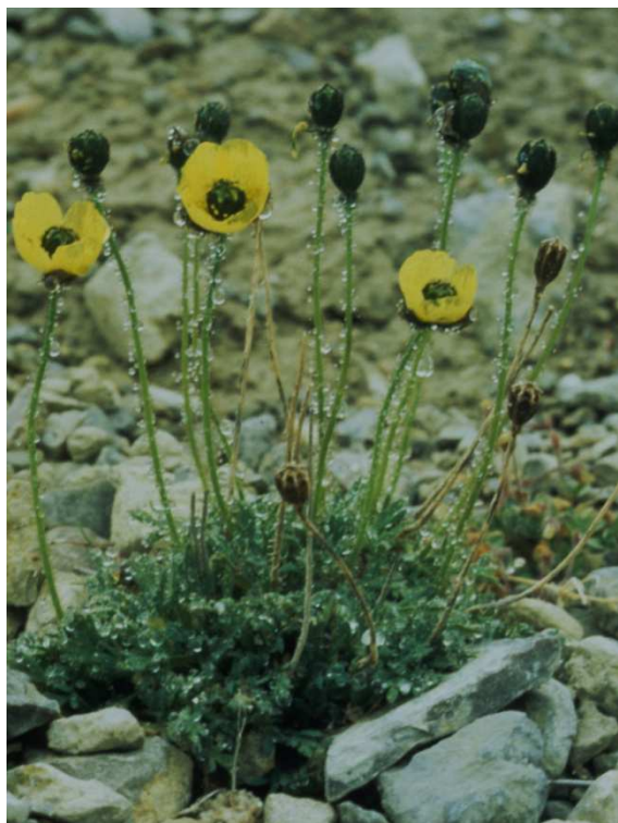
Figure 4. Rain-soaked Arctic poppies (Papaver radicatum) with flowers transfixed, pointing to the most recent sighting of the sun.

Why is the North home to so many of Clytie's disciples and why do they show such remarkable devotion to the sun?