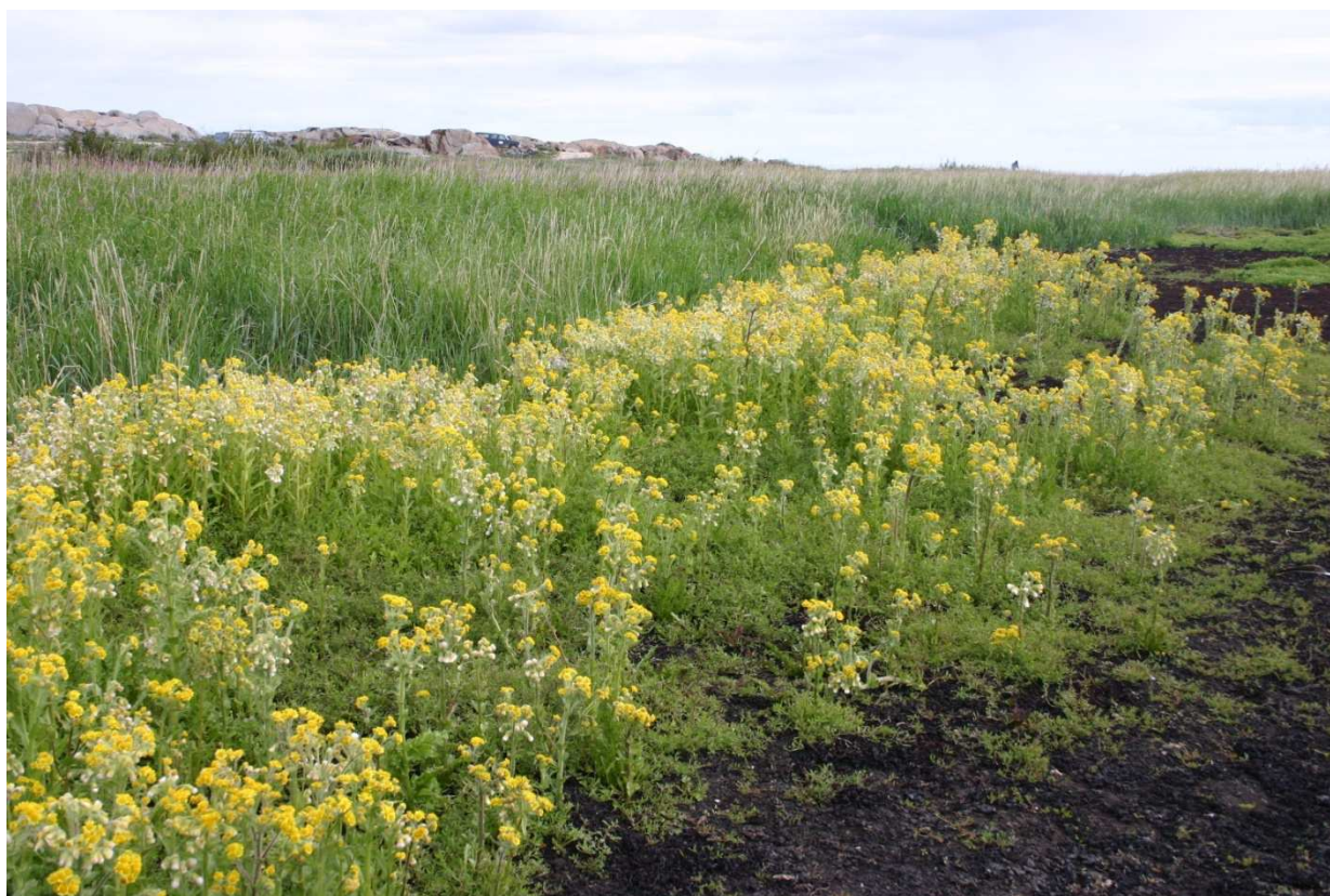
Figure 6. Herds of Mastodon flowers ( Senecio congestus ) on the shore of Hudson Bay. Their hollow stems become warmed in the sun and the heat accumulation probably allows for very rapid growth and flowering.

warming the cockles of her desires, while she remains indifferent to the science that explains her behaviour.