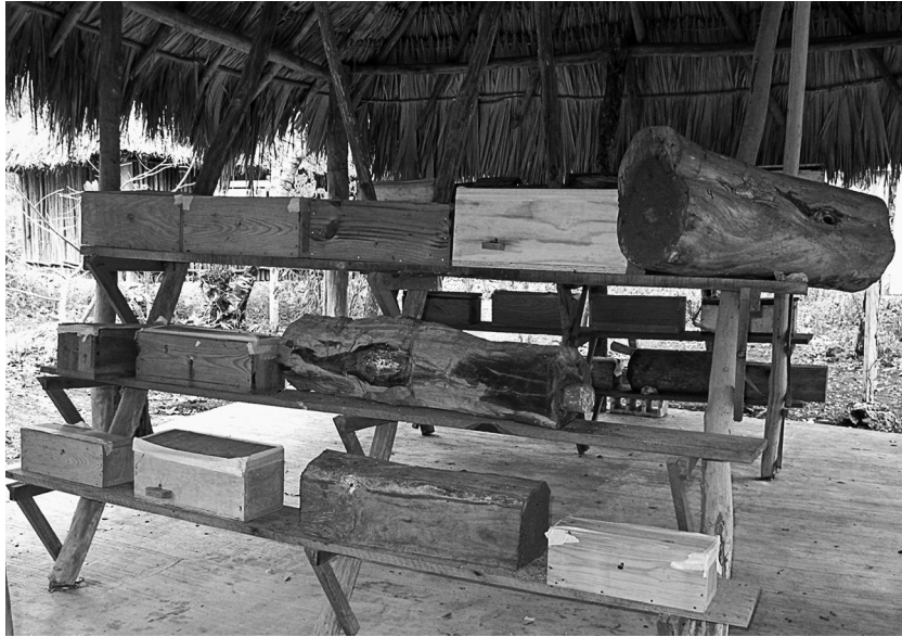
Fig. 1. Meliponary of the authors in the Zona Maya, at ECOSUR, in Chetumal, Mexico.

Francisco Javier Clavijero (1824) reported that Mexican meliponicultors owned up to 500 colonies, similar to even older reports among civilizations in South America (Roubik, 2000). Honey was the sweetener used before sugar cane Saccharum officinarum (Poaceae) was known in the American tropics, and there were no Old World honey bees, genus Apis , thus honey came from native stingless bees, bumble bees and some wasps (Roubik, 1989, 2000). Honey also was used to pay tributes, perform various rituals, and in exchange for goods (Gonzalez-Acereto et al. , 2011; Ayala et al. , 2013). Today, in the Zona Maya region discussed here, it is extremely difficult to find a stingless bee-keeper—‘meliponicultor’—with even 50 colonies. Our study species or, more likely, the only named species that represents a group of closely related Central American and Mexican bees (see Quezada-Euán et al. , 2007; Roubik and Camargo, 2012; Roubik, 2013) is widespread, and has populations in Jamaica and Cuba (Schwarz, 1932; Camargo and Pedro, 2007).