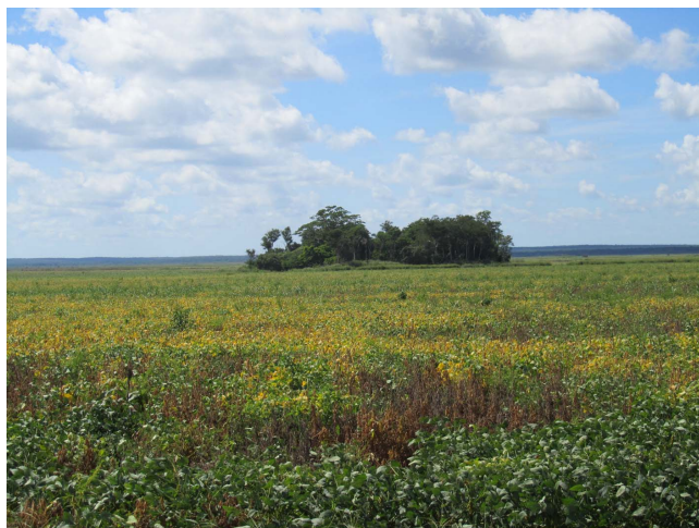
Figure 1 | Soybean field crop with forest patch in the center. The lowland forest of this region is of low stature, with a canopy less than 20 m high, and is continuous (note background), unless cleared for agriculture or livestock.

wax, from 620,521 colonies 11 . What is not commonly understood is that such colonies are environmental monitors, each having a range of some 200 km 2 in which they gather floral resources 12 . Combined with the powerful method of pollen identification of the highly diverse plants of tropical forest regions, developed first in Panama and then in the Yucatán, Mexico 13,14 , the honey bees may be used as indicators of many features in the biotic environment –including GMO plants.