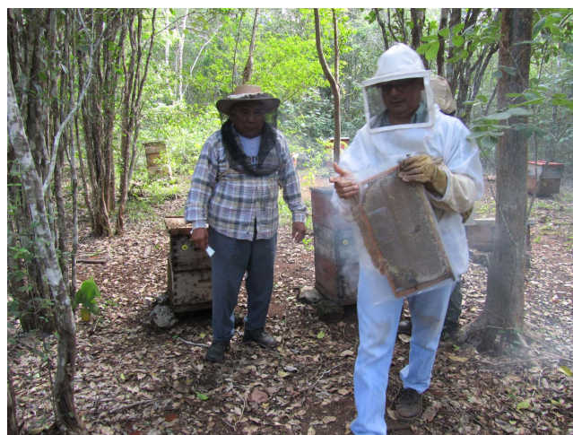
Figure 3 | Sampling honey from the apiaries installed near soybean. The owner and technician stand with a newly removed hive frame containing pure honey sealed with beeswax, within one of the thousands of small, local apiaries maintained using Africanized honey bees now resident in the Neotropics 12 .