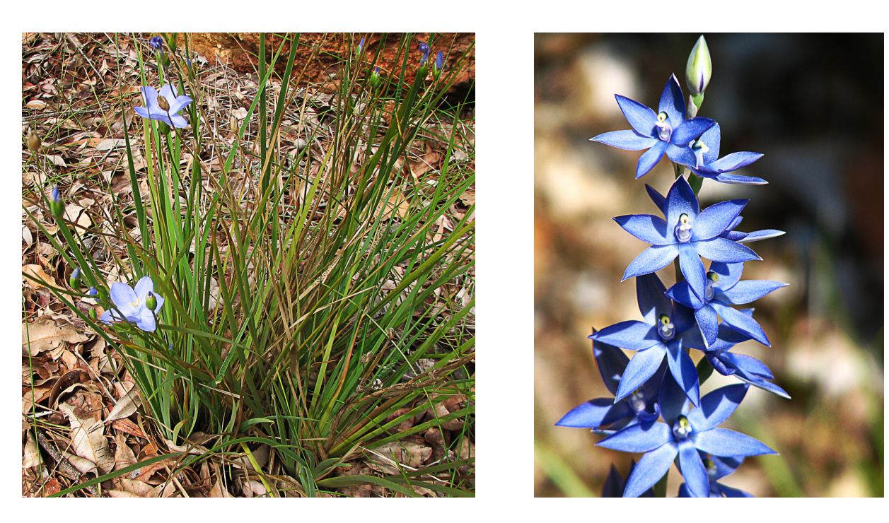
Fig. 1. Putative model (left; O. laxus) and mimic (right; T. macrophylla)