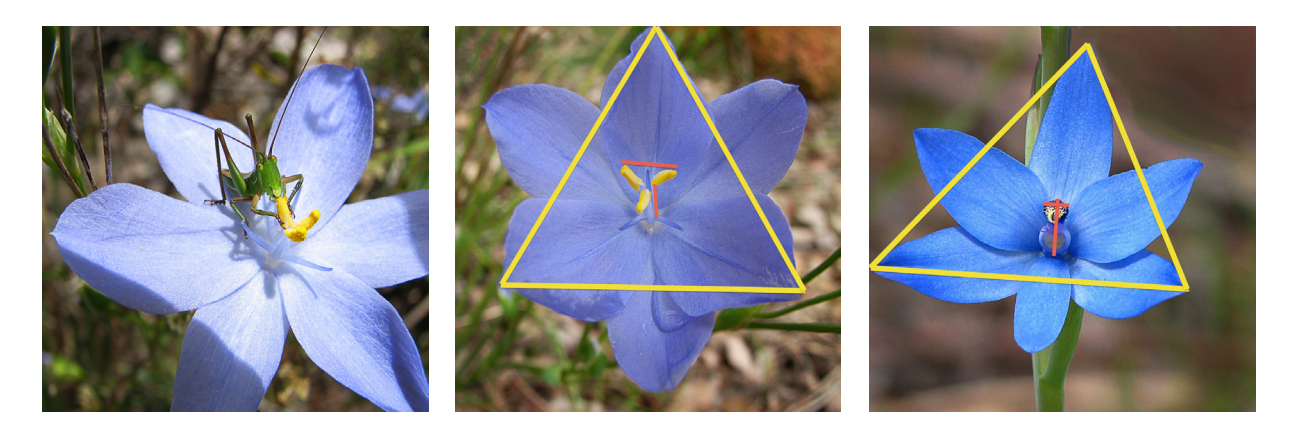
Fig. 2. High contrast yellow centers on blue flowers.

Left: Flower of O. laxus with unidentified orthopteran. Note how the insect forages specifically on one of the yellow anthers forming a central, triangular cluster.