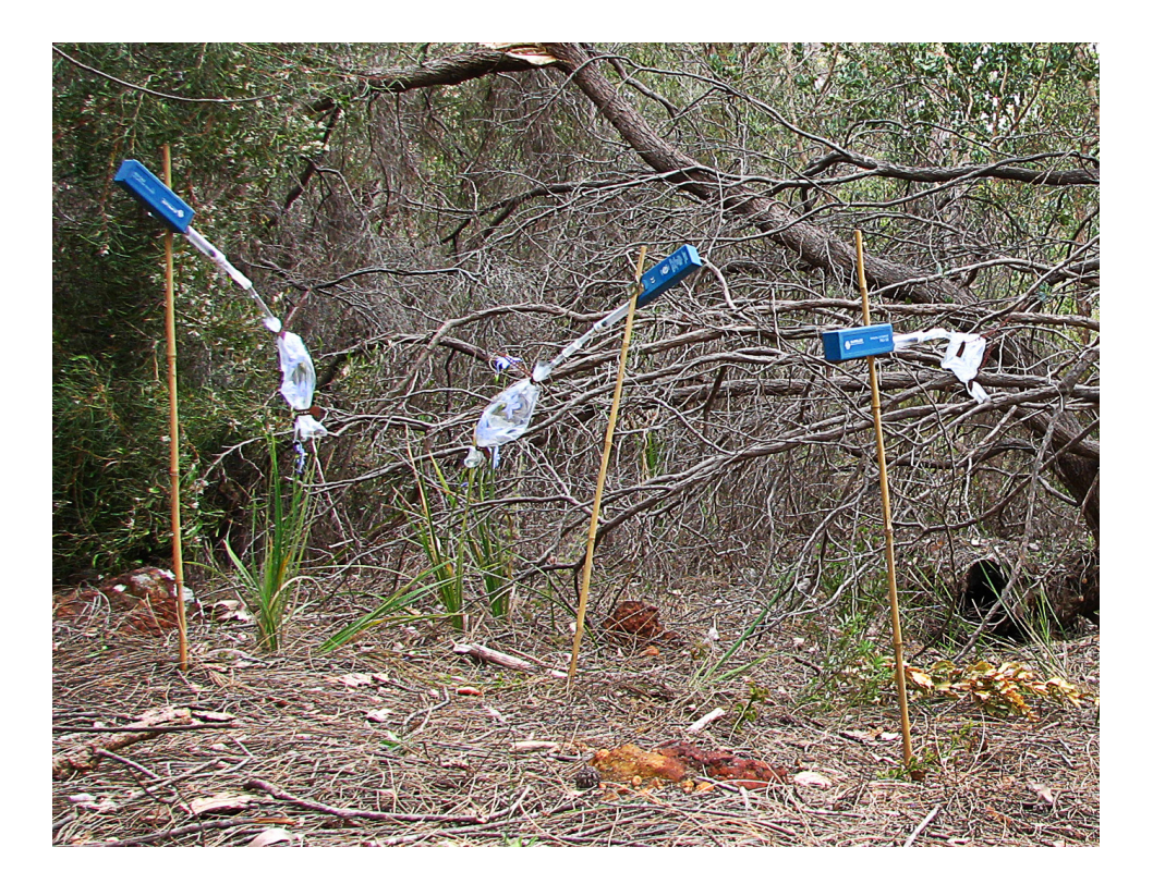
Fig. 3. Fragrance collection of O. laxus at the Lesmurdie site in October, 2009. Note that the floral fragrance collection equipment is supported by bamboo stakes.