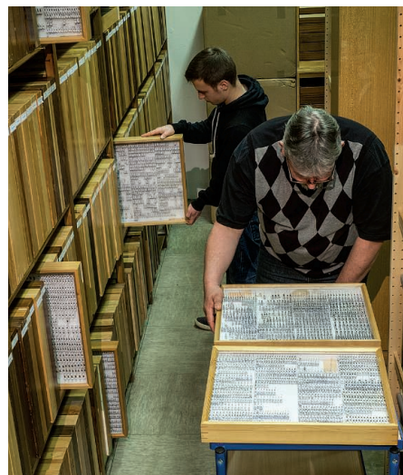
The Krefeld Entomological Society’s collections contain millions of insect specimens.

The layers revealed a striking change in the birds’ diets in the 1940s, around the time DDT was introduced. The proportion of beetle remains dropped off, suggesting the birds were eating smaller insects—and getting fewer calories per catch. The proportion of beetle parts increased slightly again