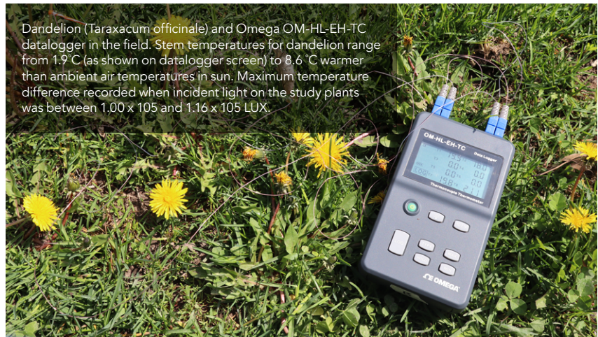
Dandelion ( Taraxacum officinale ) and Omega OM-HL-EH-TC datalogger in the field. Stem temperatures for dandelion range from 1.9 °C (as shown on datalogger screen) to 8.6 °C warmer than ambient air temperatures in sun. Maximum temperature difference recorded when incident light on the study plants was between 1.00 \times 10^5 and 1.16 \times 10^5 LUX.