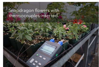
Snapdragon flowers with thermocouples inserted.

northern habitats. In addition, they implemented a biophysical model to assess microgreenhouse effects for the accumulation of solar radiant heat in the hollow stems of herbaceous plants found around Magadan in far eastern Russia, a shaped by mountainous landscapes and a high diversity of plants species adapted to the subarctic climate