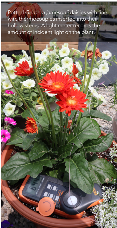
Potted Gerbera jamesonii daisies with fine wire thermocouples inserted into their hollow stems. A light meter records the amount of incident light on the plant.