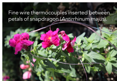
Fine wire thermocouples inserted between petals of snapdragon ( Antirrhinum majus ).